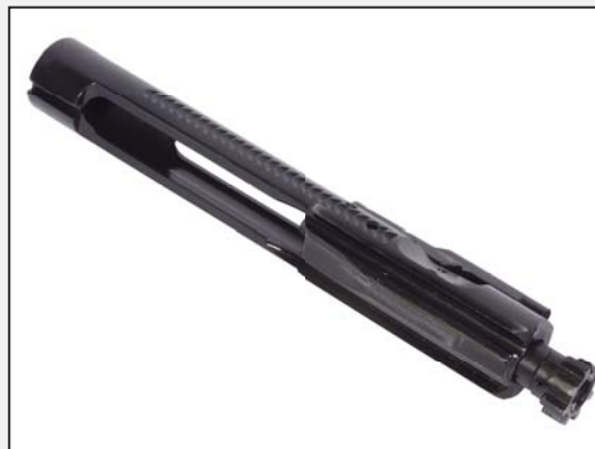
AMSOIL Synthetic Firearm Lubricant provided exceptional performance over rigorous range testing in multiple firearm applications.