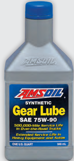
75W-90 (FGR) & 80W-140 (FGO)

Use AMSOIL Long Life Synthetic Gear Lube in differentials, manual transmissions or other gear applications where one or more of the following standards are specified: API GL-5 & MT-1, MIL-PRF-2105E, Dana* SHAES* 234 (Formerly Eaton* PS-037) for 250,000 miles, Dana SHAES 256 (Formerly Eaton PS-163) for 500,000 miles, Dana SHAES 429A, Mack* GO-J & GO-J+, Meritor* 0-76N (75W-90) & 0-80 (80W-140) plus hypoid gear oil specifications from ZF TE-ML 07A and 08 foreign and domestic manufacturers such as GM*, Ford* and Daimler* Chrysler*. It can also be used in rear axles where API Service GL-4 lubricant is recommended.