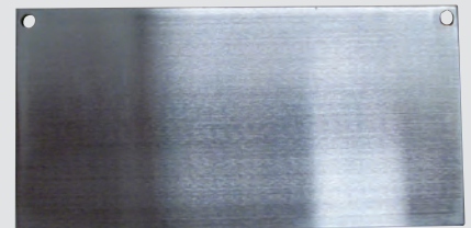
After 192 hours in a humidity cabinet, the metal coupon treated with Z-ROD Synthetic Motor Oil showed no signs of rust or corrosion.